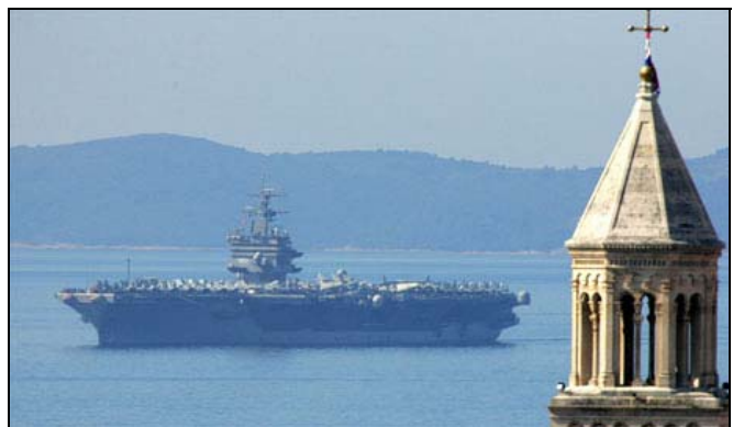
Pictured is Split Cathedral Saint Dujam with USS Enterprise