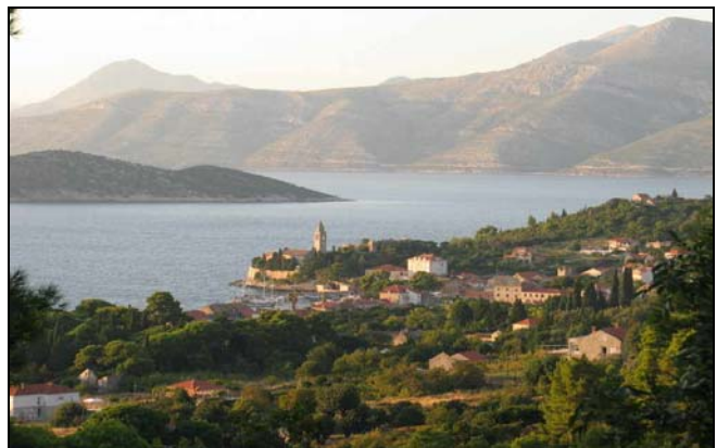
Lopud Island

To read the whole article, visit: http://msnbc.msn.com/id/12853420/print/1/displaymode/1098/