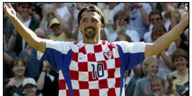
The Laureus Award, known as the most prestigious sports award worldwide, is given by the Laureus Academy. Croatian tennis player Goran Ivanišević, a Wimbledon Cup winner, is the only other Croatian athlete to have won the Laureus Award.

Swiss tennis superstar Roger Federer was named Laureus World Sportsman of the year for the second consecutive year with the women's honor going to Croatian skier Janica Kostelić. The 23-year-old Kostelić, who won the women's combined event at the Turin Olympics, beat off rivals including Yelena Isinbayeva, the first woman to pole vault over five meters, U.S. Open tennis champion Kim Clijsters and Swedish golfer Annika Sorenstam. Janica Kostelić became the first woman to win four Alpine skiing gold medals after her victory in the women's February's Winter Olympics in Turin. Once again she had to overcome injury and illness to triumph having been forced to pull out of the Olympics downhill because she was unwell. Four years ago she won three gold medals at the Salt Lake City Olympics after fighting back from three knee operations in 12 months.