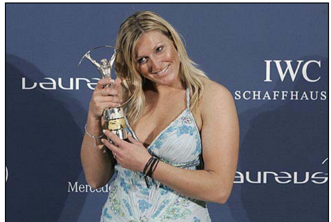
Croatian skier Janica Kostelić poses with the Laureus Sportswoman of the Year Award trophy in Barcelona.

BARCELONA, Spain, May 24 – The world's best skier, Janica Kostelić was presented with the Laureus Sportswoman of the Year Award at a ceremony in Barcelona.