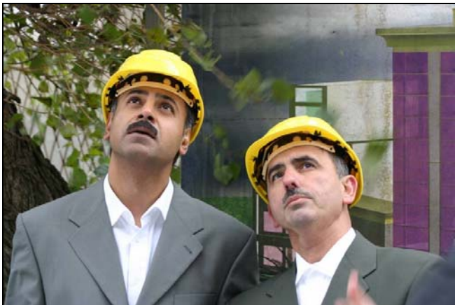
Scene from the movie "What Is a Man Without Mustache?"

NEW YORK, N.Y., May 25 – New York Times featured a review of the Croatian movie "What Is a Man without a Mustache" directed and produced by Hrvoje Hribar, which opens on May 25, 2006 at the Two Boots Pioneer Theater, 155 East Third Street, at Avenue A, East Village, New York.