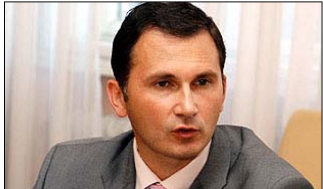
Minister of Science, Education and Sport Dragan Primorac have announced that the attendance of secondary school will become mandatory as of fall 2007. With this initiative, the Croatian educational system will become one of the most competitive in Europe by 2010 and will help in the fight against unemployment.

ZAGREB, Croatia, May 15 - Prime Minister Ivo Sanader and Minister of Education Dragan Primorac have announced that attendance of secondary school will become mandatory as of fall 2007. The move is part of the Government's development strategy, which relies on the acquisition of knowledge and skills in order to make Croatia more competitive internationally.