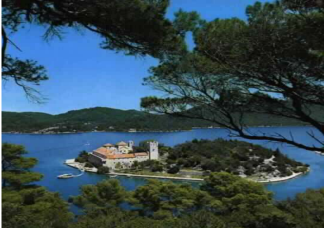
An island within the island: National Park Mljet is home to a 12 th century Benedictine monastery.