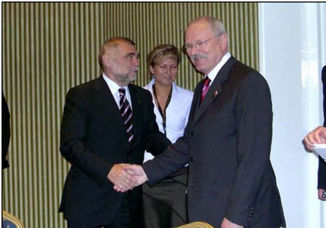
Croatian President Stjepan Mesić met with Slovakian President Ivan Gašparovič at the summit in Varna, Bulgaria

VARNA, Bulgaria, May 19 – Thirteen Presidents of Central European countries met in Varna for their annual summit and confirmed they had a major common goal – a united Europe. The Heads of State of Central Europe supported the admission of Bulgaria and Romania to the European Union as well as Croatia's entry into the Union as soon as possible.