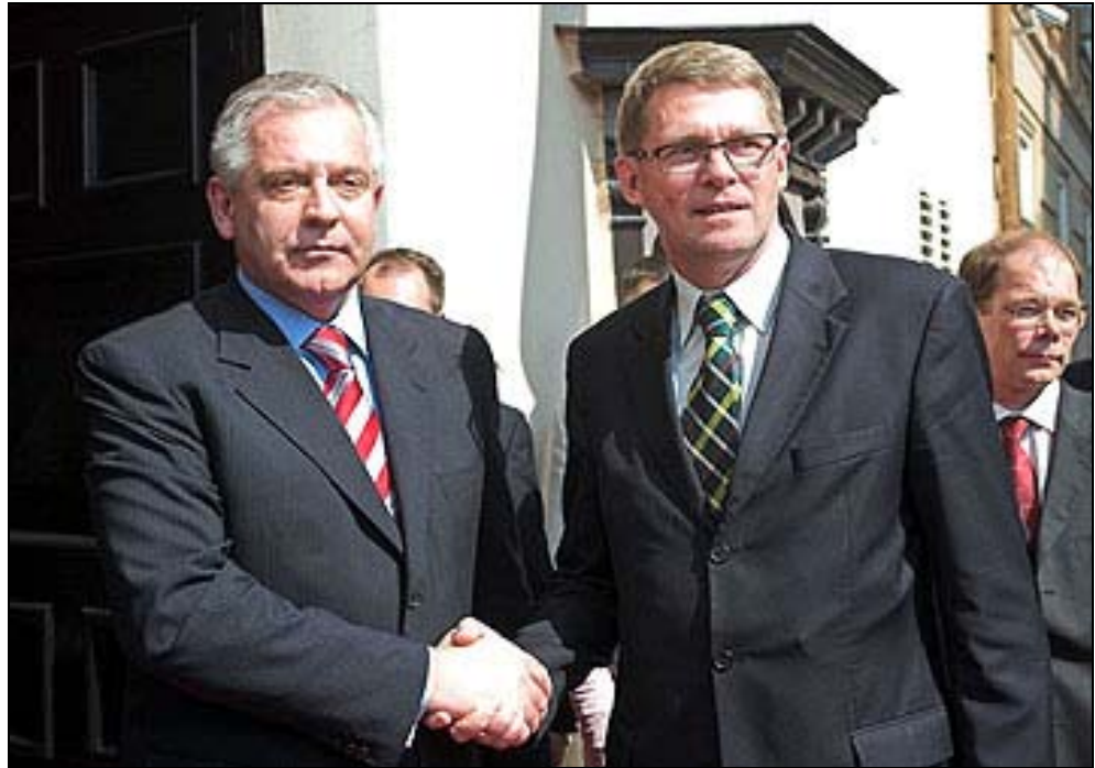
Croatia will become an EU member as soon as it meets its requirements, Finish Prime Minister Matti Vanhanen (right) said during his meeting with Croatian Prime Minister Ivo Sanader in Zagreb.