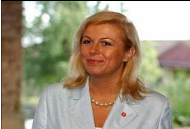
The election of Croatia into the UN Commission for Peacebuilding is one of the greater diplomatic successes on the path of Croatian affirmation in the international community, said Minister of Foreign Affairs and European Integration Kolinda Grabar-Kitarović.

NEW YORK, N.Y., May 17 – Croatia was elected to the United Nations Peacebuilding Commission, a newly-established advisory body aimed at helping countries emerging from conflict not to revert to violence. Croatia is the first Southeast European country to join this UN body.