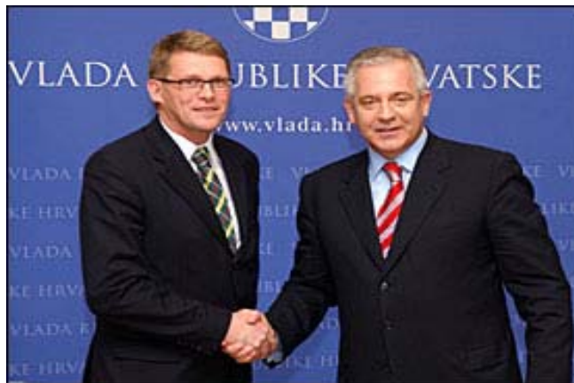
Pictured are Finnish Prime Minister Matti Vanhanen and Croatian Prime Minister Ivo Sanader.

ZAGREB, Croatia, May 18 – 23 - Last week Croatian Prime Minister Ivo Sanader met with Finish Prime Minister Matti Vanhanen, Macedonian Prime Minister Vlado Bučkovski and Slovakian Prime Minister Mikulas Džurinda