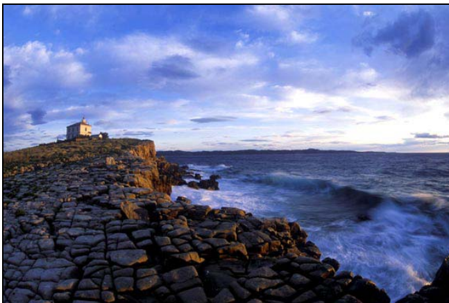
Pločica - the tiniest island in the Adriatic Sea

Today these three islands are popular destinations for tourists from all over the world.