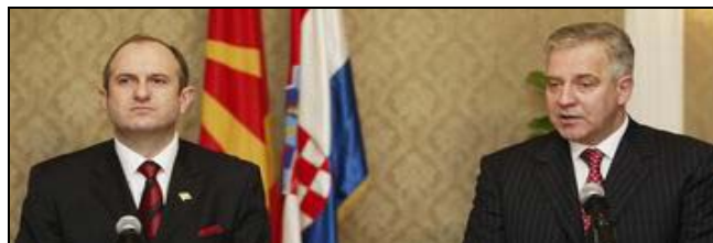
Macedonian Prime Minister Vlado Bučkovski and Croatian Prime Minister Ivo Sanader

During its presidency of the European Union in the second half of this year, Finland will continue supporting EU enlargement, Finnish Prime Minister Matti Vanhanen said during his visit to Zagreb. Finland takes over the six-month EU presidency from Austria on July 1 this year. The Finnish Prime Minister said that the EU must honor its obligations and that Croatia will become a EU member as soon as it meets all the requirements. Prime Minister Sanader said that Croatia expects most reports on negotiation chapters to be completed during the Finnish presidency and that he expects those six months to be very dynamic.