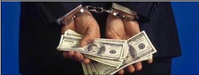
Prime Minister Sanader said that fighting corruption must be a common goal of all Croatian citizens

ZAGREB, Croatia, March 10 – Croatia will fight corruption not because the European Union demanded it but because the public expects it, Prime Minister Ivo Sanader said at a round table debate in the Croatian Academy of Arts and Sciences called “The National Program on Corruption Prevention.” The main objective of the anti-corruption plan is to reduce corruption as much as possible, with the help of all factors in society, said Prime Minister Sanader adding that regardless of political beliefs, fighting corruption must be a common goal for everyone.