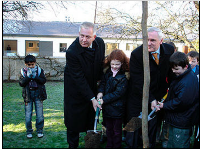
Croatian Prime Minister Ivo Sanader and his Irish counterpart Bertie Ahern, who strongly supported Croatia's drawing closer to the European Union, planted the Irish Strawberry Tree at the state residence on the occasion of National Tree Week, which Ireland has been holding for more than two decades in view of raising ecological awareness.

DUBLIN, Ireland, March 3 - The enlargement of the European Union has been its most successful foreign policy achievement, according to the man who, as the EU's External Relations Commissioner, presided over its biggest ever expansion. Chris Patten told the National Forum on Europe that enlargement should continue, as long as candidate countries meet the criteria for entry. Lord Patten, who is now Chancellor of Oxford University, said he particularly strongly supported the application to join by Croatia, whose Prime Minister Ivo Sanader addressed the same Forum session in Dublin Castle.