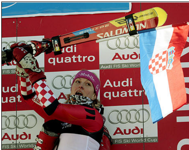
Janica Kostelic clinched the World Cup title in the Super-G race, coming in 4th on Thursday, and winning the slalom on Friday in Are, Sweden. During the entire ski season, Janica showed impressive results and displayed great patriotism for her homeland.