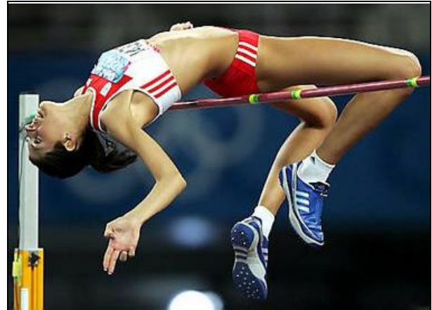
Croatian athlete, Blanka Vlašić is on her way to becoming the best in the world in the high jump discipline.

Embassy of the Republic of Croatia 2343 Massachusetts Avenue, NW 20008