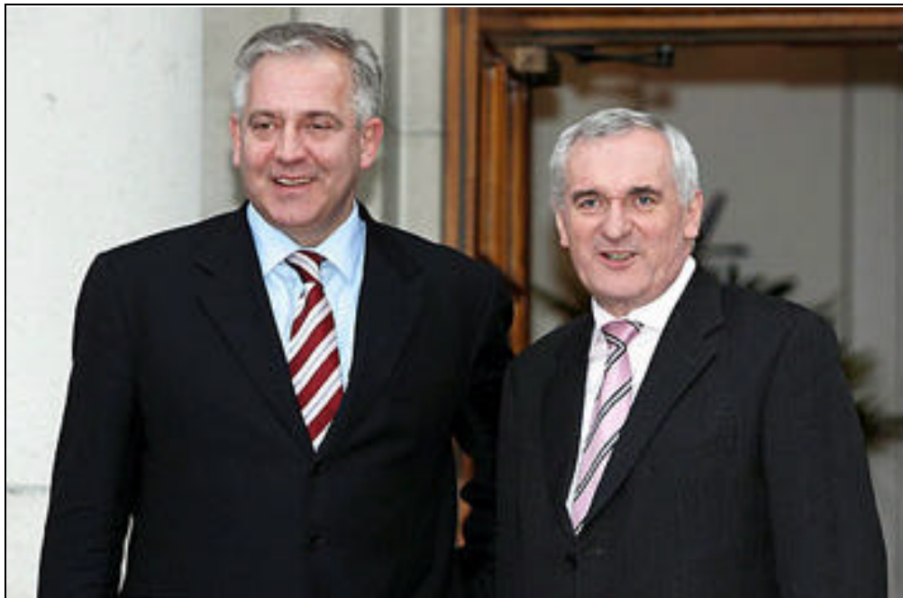
Above: Croatian Prime Minister Ivo Sanader (left) along with his Irish counterpart Bertie Ahern, who praised Croatia for its progress in meeting EU membership requirements