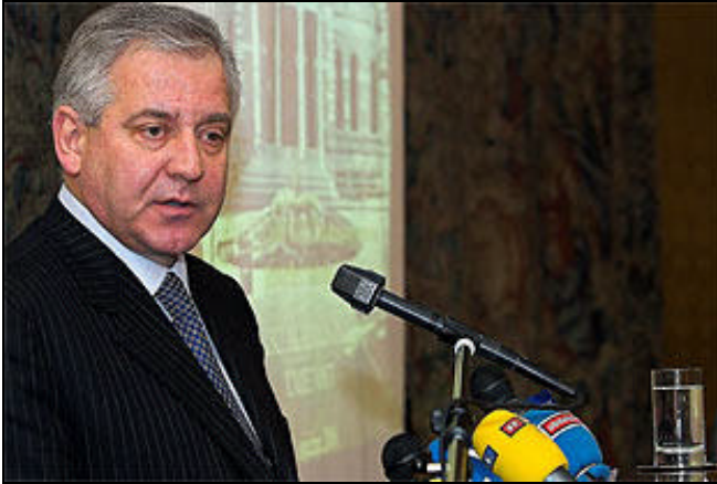
Prime Minister Ivo Sanader announced strong measures in the fight against corruption.

ZAGREB, Croatia, March 10 – Croatia will fight corruption not because the European Union demanded it but because the public expects it, Prime Minister Ivo Sanader said at a round table debate in the Croatian Academy of Arts and Sciences called “The National Program on Corruption Prevention.” The main objective of the anti-corruption plan is to reduce corruption as much as possible, with the help of all factors in society, said Prime Minister Sanader adding that regardless of political beliefs, fighting corruption must be a common goal for everyone.