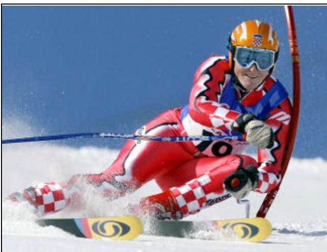
Janica Kostelic is one of the best athletes in the world.

ARE, Sweden, March 16 – Croatian skier Janica Kostelic clinched the women's overall title by coming in fourth in the women's super-G race on Thursday, but it was her spectacular performance on Friday - she captured first place