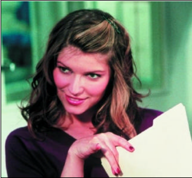
A rising star: Ivana Milicevic

ZAGREB, Croatia, March 14, 2006 – Even though it has been decided that Goran Višnjić will not be the new James Bond, an actress with Croatian roots, Ivana Milicevic, has secured a role in the latest Bond movie, “Casino Royale,” opening later this year. Ivana, who has since 1983 lived in the U.S. with her family, will play the role of Valenka, wife of the bodyguard of the main villain in the film. The Croatian actress started her career as a model, subsequently turning to acting and appearing in popular TV shows such as Seinfeld, Felicity and Buffy, but also in films Vanilla Sky, Jerry Maguire and Resident Evil. Ivana may not be a new Bond girl – this honor went to Eva Green – but her appearance in “Casino Royale” is definitely one big step forward for her career.